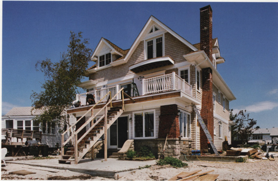
A waterfront home in Groton, CT, near completion by Yankee Remodeler of New London.