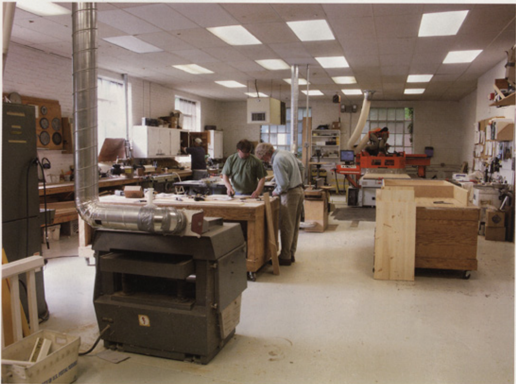
Step 3: The cut sheets are reviewed with the shop foreman.